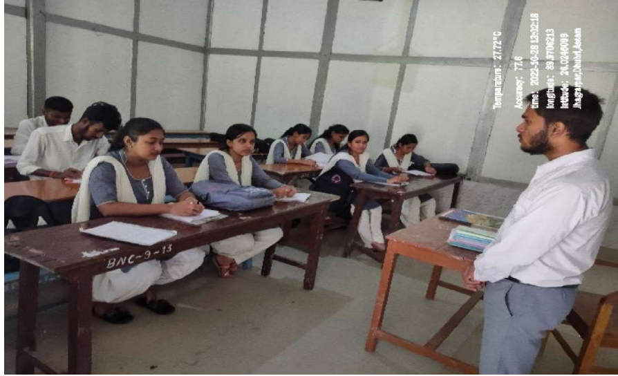
Students of B. A. 5th Semester Honours Class attending the class